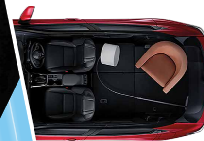
04 Utility mode