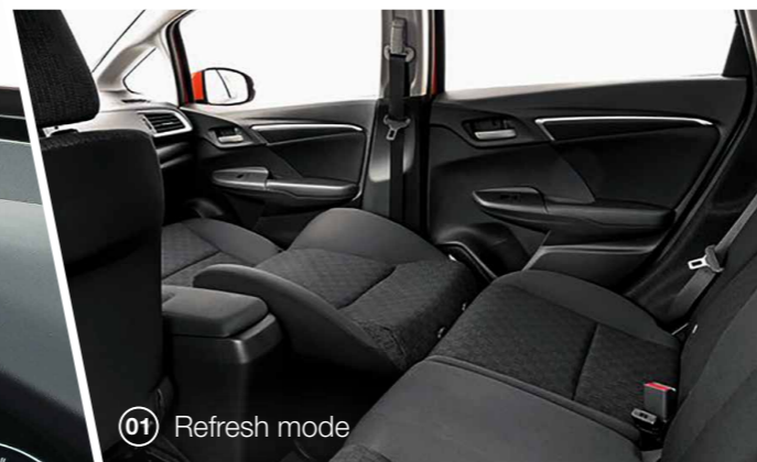
01 Refresh mode