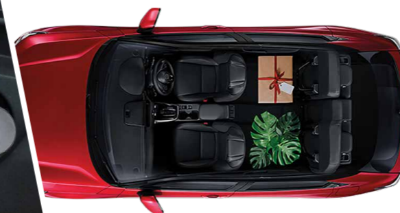
02 Tall mode