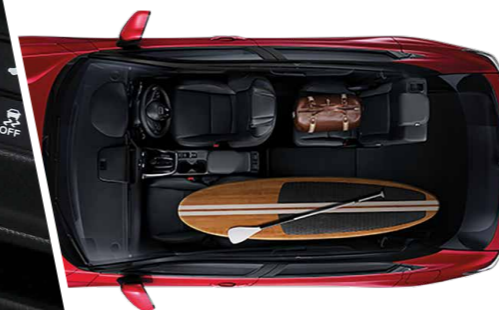
03 Long mode