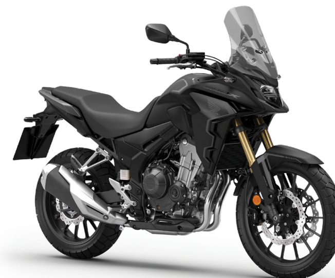
● Matt Gunpowder Black Metallic

The 22YM CB500X will be available in the following colour options: