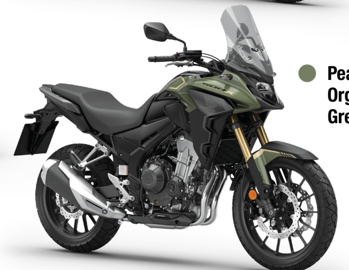
● Pearl Organic Green