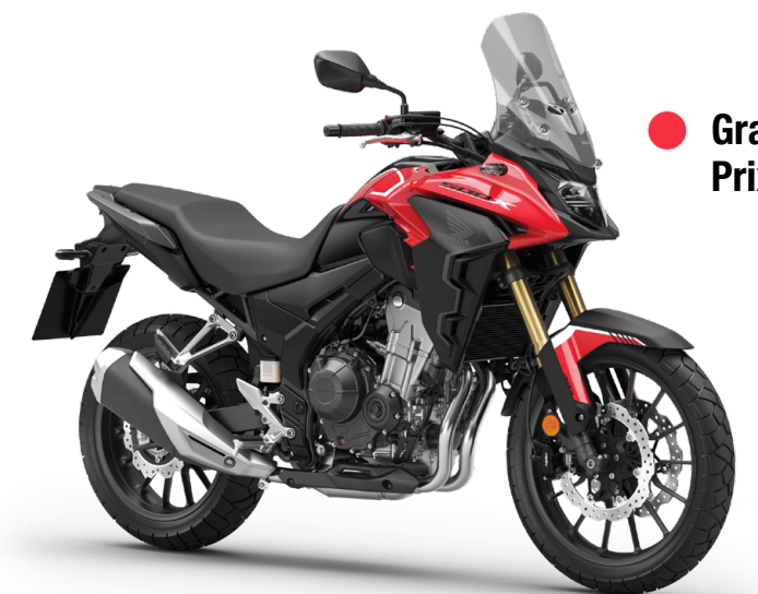
● Grand Prix Red