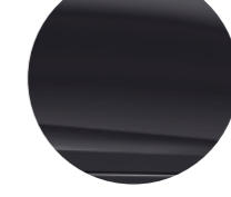
Meteoroid Grey Metallic