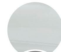
Platinum White Pearl

The colour of your car is important to you, so it's important to us. With an updated range of colours to choose from, there is always one to suit your style and preferences.