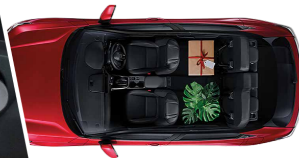
02 Tall mode