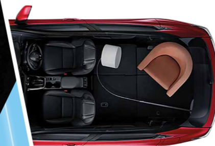
04 Utility mode