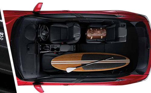
03 Long mode