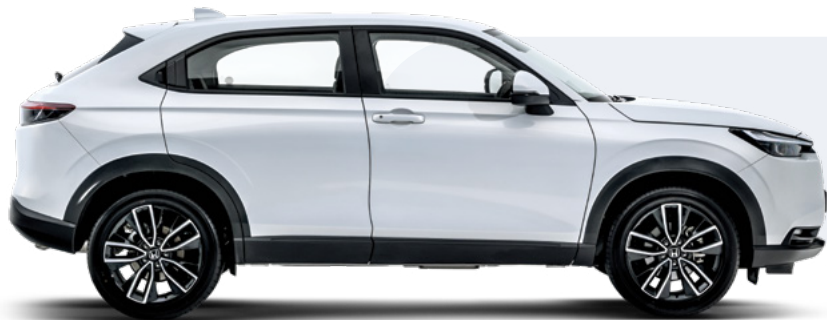
Opal White Pearlescent

Available in four striking colours, perfectly paired with its modern design. Choose from Opal White Pearlescent, Meteoroid Grey Metallic, Brilliant Sporty Blue Metallic or Coffee Cherry Red Metallic.