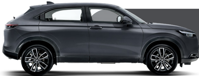
Meteoroid Grey Metallic