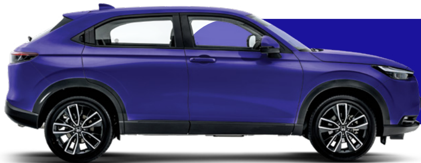
Brilliant Sporty Blue Metallic