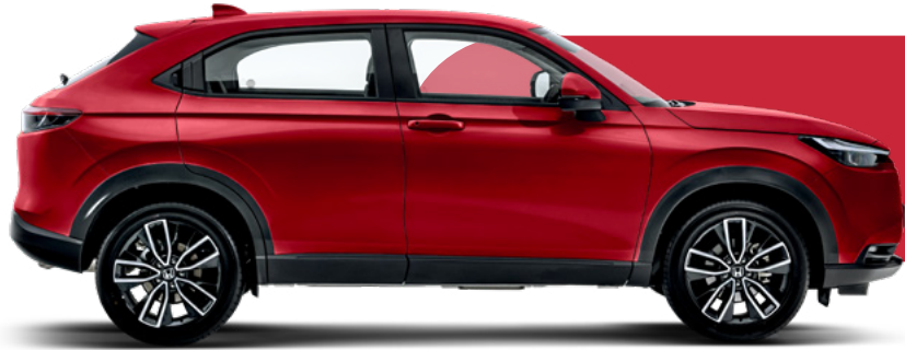
Coffee Cherry Red Metallic